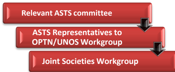
Figure 1: Joint Societies Workgroup Composition

The Joint Societies Workgroup will seek input from the ASTS Committee throughout the development process. Regular updates will be provided to the Executive Committee to provide for ongoing feedback to the ASTS representatives on the Workgroup and the relevant ASTS Committee. Updates to the council will be provided at scheduled meetings three times a year or intermittently via email if the Executive Committee does not unanimously support a proposal or recommendation (Figure 2).