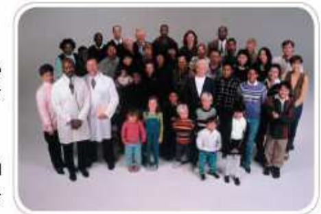
A Leader in Public Protection.

FCVS obtains primary source verification of medical education, postgraduate training, examination history, board action history, board certification and identity. This repository of information allows a physician and/or physician assistant to establish a confidential, lifetime professional portfolio with FCVS which can be forwarded, at the physician's request, to any state medical board that has established an agreement with FCVS, hospital, health care or any other entity.