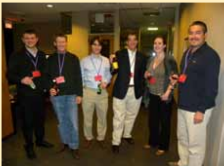
Participants and faculty enjoy networking reception

The ASTS LDP is truly an outstanding opportunity for transplant surgeons and other team members to gain a better understanding of financial issues and building a successful program in today's healthcare environment. I highly recommend this course for every transplant surgeon or physician in a leadership position and intend to send every key member of my team.