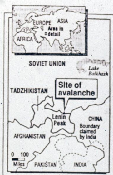
The Arizona Republic

Soviet officials never have acknowledged the loss, but Polish climbing experts reported that 40 mountaineers